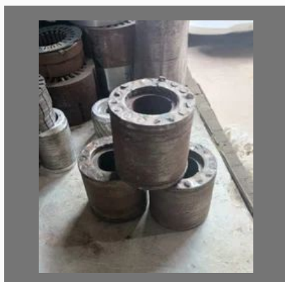
Copper Brazing Rotor