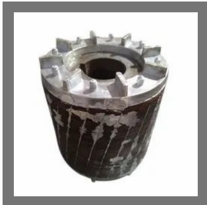
CRC Motor Stamping