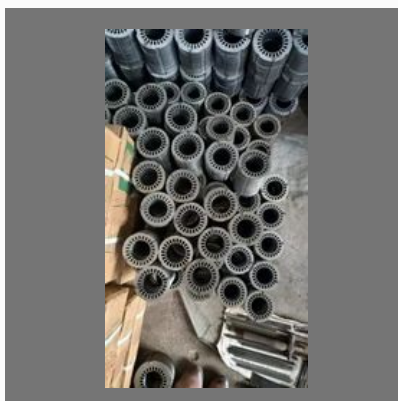
Electrical Motor Core Stamping