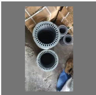
Crc Electrical Stamping