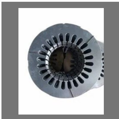
CRC Lamination Stamping