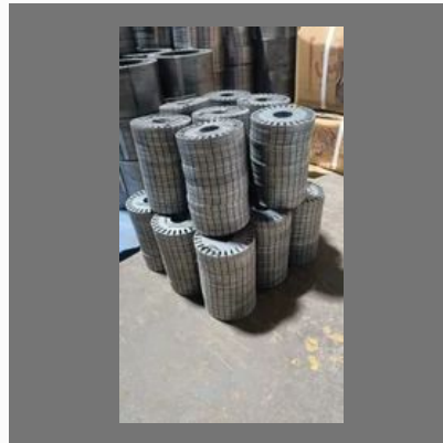
Motor Electrical Stampings