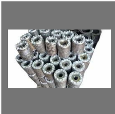
Aluminum Pressure Die Cast Rotor