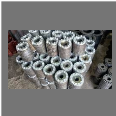
Aluminium Die Cast Rotor