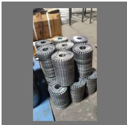
Motor Stamping For Electric Motor