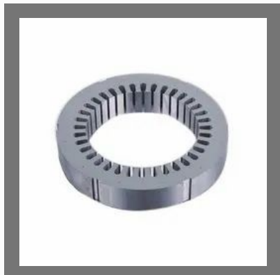
Submersible Motor Stamping